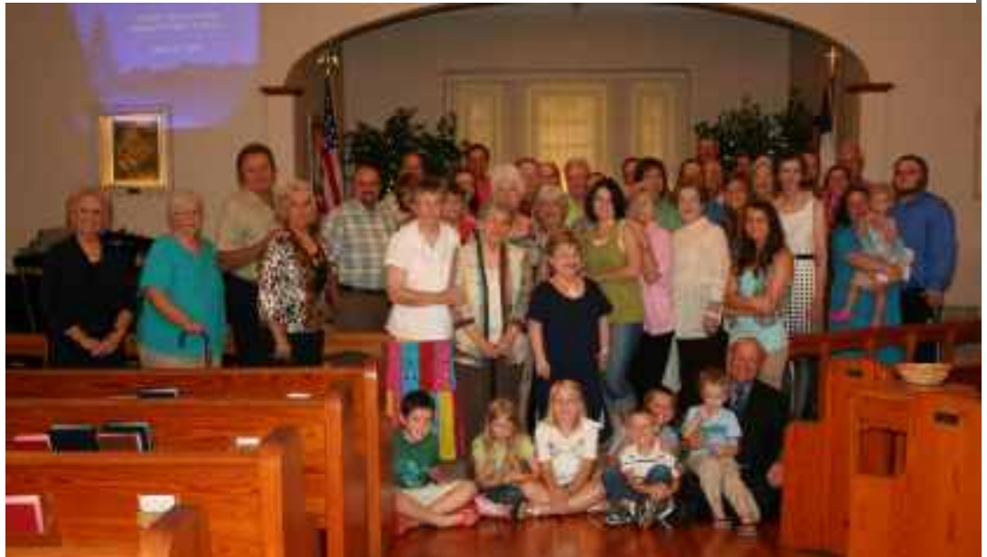
Smiling Methodist Faces